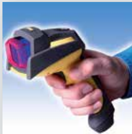
2D Data Matrix Barcode Reader DNR-7500V-00 CIM P/N C7010972