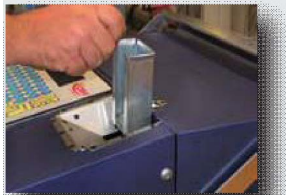
Interchangeable input hoppers for dog tags and medical alert tags for easy change