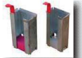
Medical alert tags & dog tags