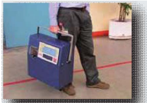
Easy to carry handle